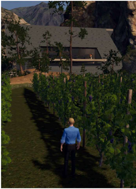
Fig. 2. Oltrepò Pavese vineyards in Enoverse.

workshops aimed at promoting Buttafuoco Storico's winemaking traditions to a wider audience. The number of participants in these workshops reached over 3000, which demonstrated the efficacy of the model and growing public interest in such experiences.